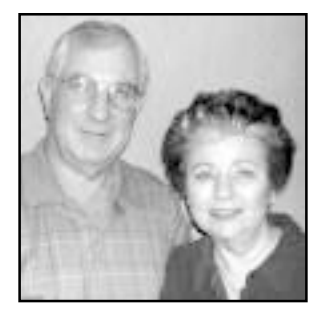
Thurs Aft Strat Open Prs C