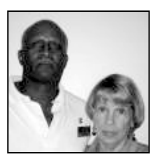
Fri Aft Strat Open Prs A