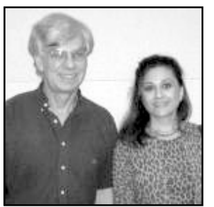
Sun Strat Open Prs A