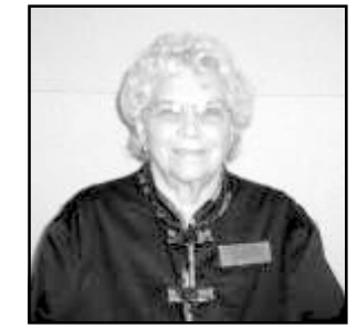
Sat Choice Prs B